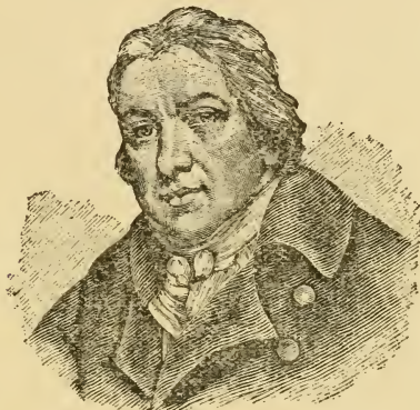
FIG. 360.—EDWARD JENNER, M.D. (CELEBRATED ENGLISH PHYSICIAN, AUTHOR, AND DISCOVERER OF VACCINATION.)

The best form for a surgeon who attempts the most severe,